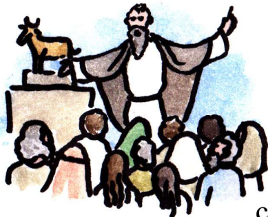
Joshua 24:1-2, 15-18

In today's first reading, Joshua told the people that they had to choose between the false gods and the true God. Joshua and the people chose to worship the true God.